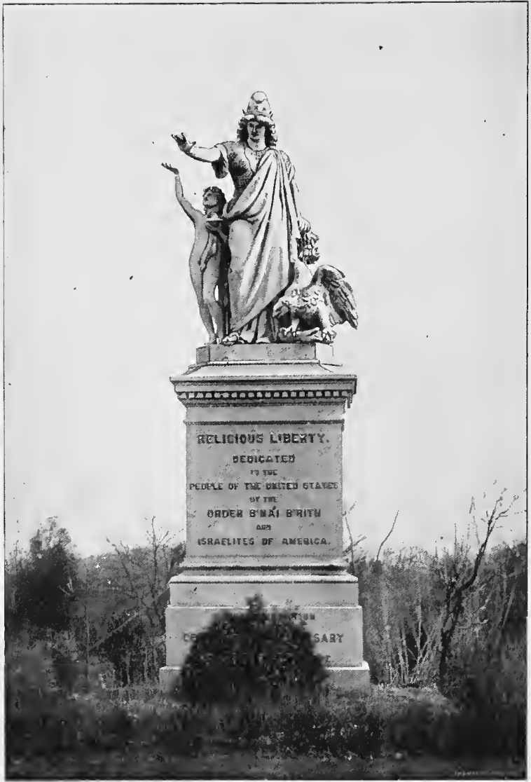
STATUE OF RELIGIOUS LIBERTY, Fairmount Park, Philadelphia.